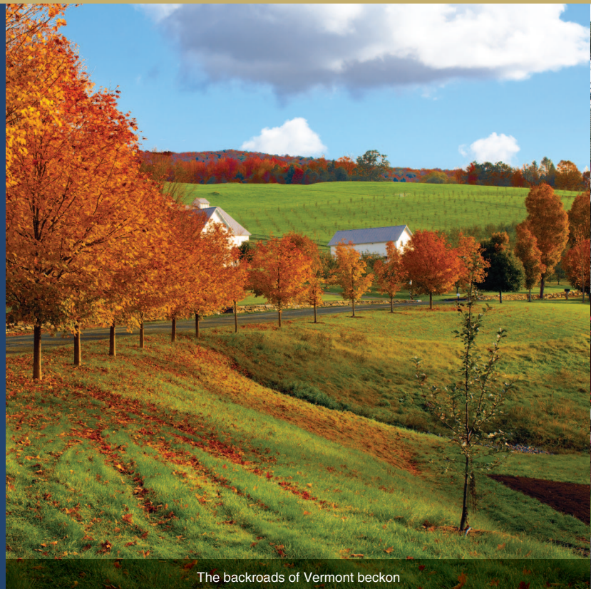
The backroads of Vermont beckon