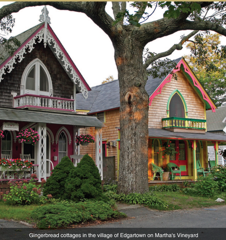
Gingerbread cottages in the village of Edgartown on Martha's Vineyard