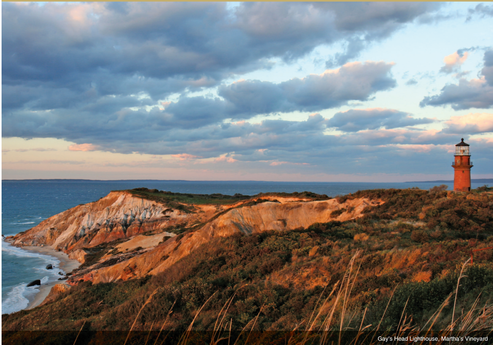
Gay's Head Lighthouse, Martha's Vineyard